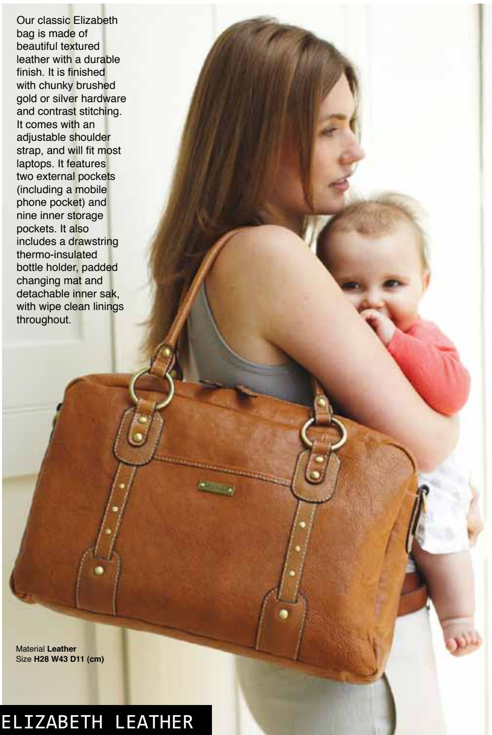
Material Leather Size H28 W43 D11 (cm)

Our classic Elizabeth bag is made of beautiful textured leather with a durable finish. It is finished with chunky brushed gold or silver hardware and contrast stitching. It comes with an adjustable shoulder strap, and will fit most laptops. It features two external pockets (including a mobile phone pocket) and nine inner storage pockets. It also includes a drawstring thermo-insulated bottle holder, padded changing mat and detachable inner sak, with wipe clean linings throughout.