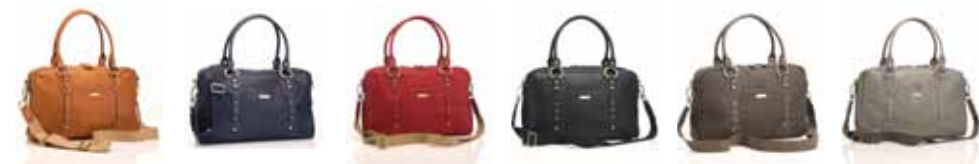
Colour TAN, NAVY, RED, BLACK, WALNUT, DOVE GREY (Left to Right)

THE WORLD'S FINEST LIVING MAGAZINE Junior DESIGN AWARDS 2011 BEST CHANGING BAG WINNER